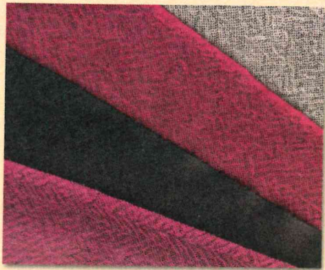
鄂尔多斯1436羊绒围巾 Erdos 1436 Cashmere Scarf