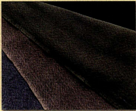
鄂尔多斯1436羊绒围巾 Erdos 1436 Cashmere Scarf